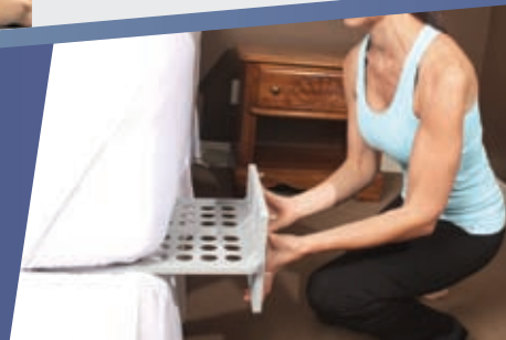
A Insert stabilizer between box spring and mattress

This new, innovative system features advanced durable design and hypoallergenic comfort pillows.