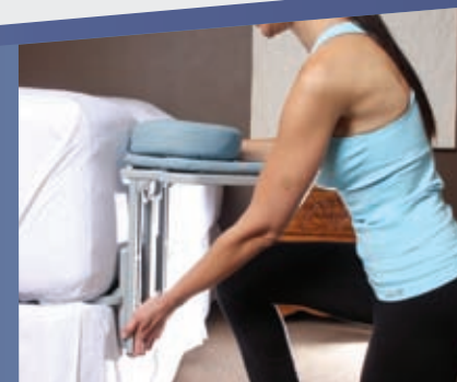
B Attach adjustable face cradle plate