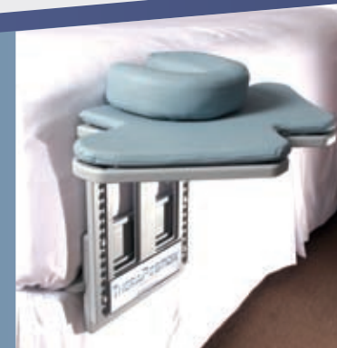
C Attach pillows